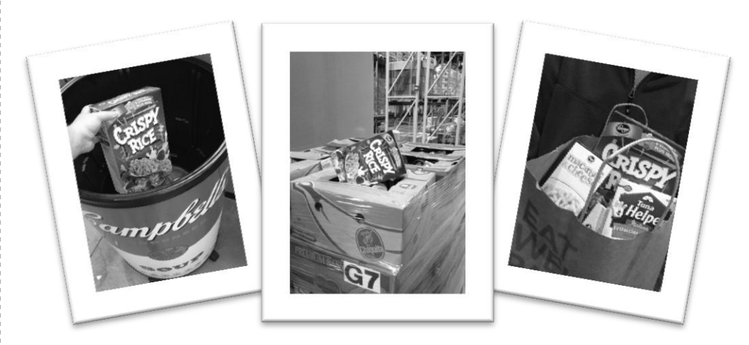
From Your Home to Theirs – Making a Difference, One Donation at a Time

FOLLOW THE FOOD - Last month we told you about the operations and schedule here at your Kansas Food Bank. This month, let's follow the food! What exactly happens to the food that is brought into the warehouse and placed in the bin at the front desk? First it goes off to the sort room where it is packed with like items in boxes. From there, it moves to the racks where it awaits an agency order. Once asked for by one of our partner agencies, it goes onto a pallet with all the other items the agency ordered and it is ready for pick up or transport to the agency. At the agency, it gets unloaded onto their shelves and is ready for its final destination, to a family home where it will be greatly appreciated.