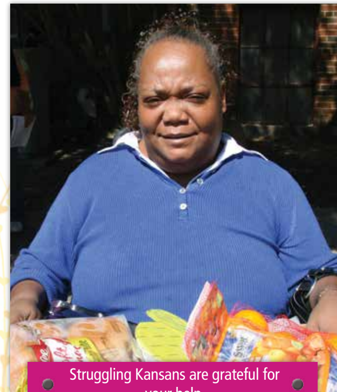
Struggling Kansans are grateful for your help.