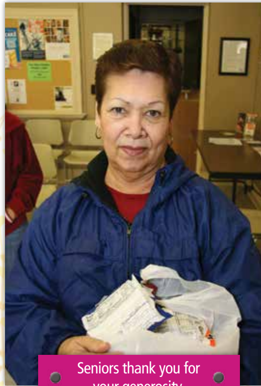
Seniors thank you for your generosity.