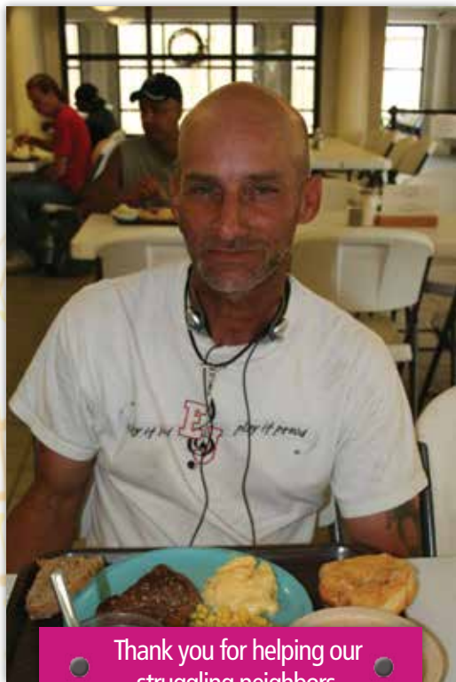
Thank you for helping our struggling neighbors.