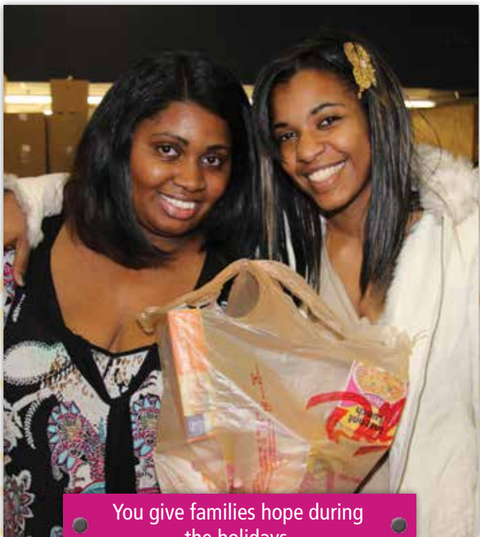
You give families hope during the holidays.