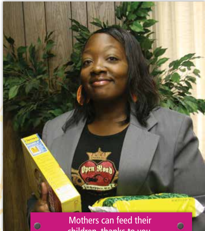
Mothers can feed their children, thanks to you.