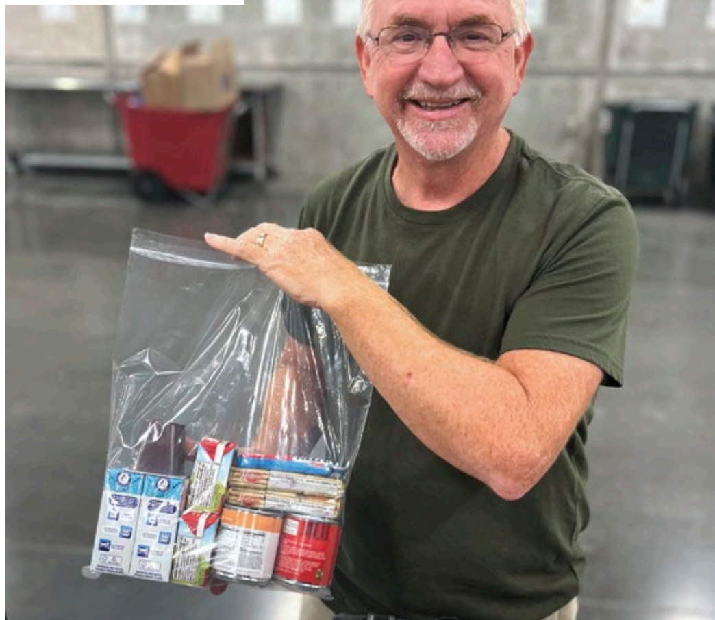
Rusty prepares a package of food for the Food Bank’s Food 4 Kids program.

“ It’s really powerful to hear from families and [the food] is definitely making a difference. ”